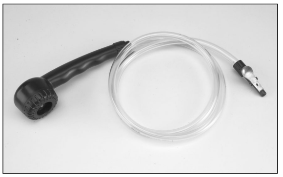
Spray Adapter 48" long hose easily attaches to faucet of Hot Water on Demand™ with Quick-connect fitting. Handled spray head is ideal for a light shower. Not Included (#2300-512)